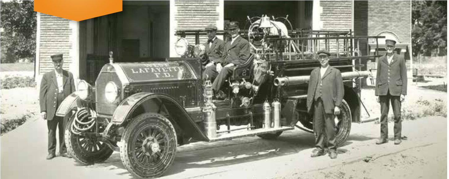
WLFD has come a long way since 1917!