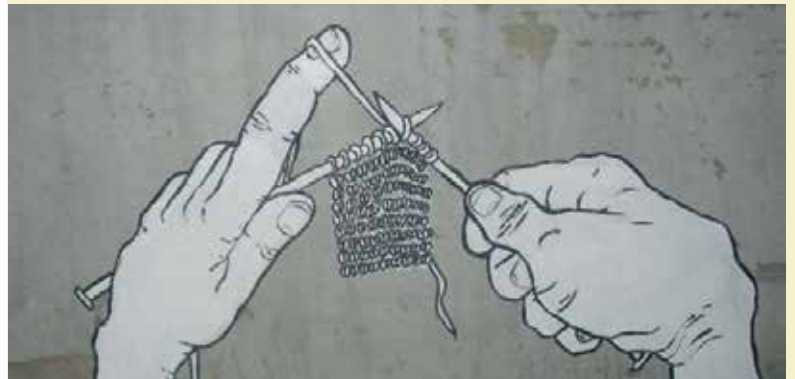
Tiny Places (one of 19 pieces) by Aaron Bumgarner